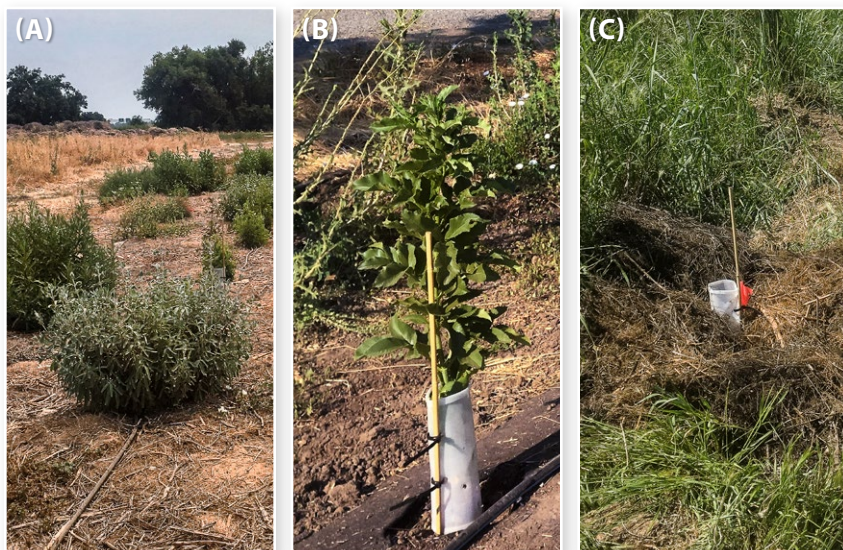
Figure 6. Organic mulch and plastic landscape fabric used on farms in the field demonstration trial during the first growing season. Farm 1 (A) laid a thick layer of partially decomposed asparagus fern on top of cardboard. Farm 2 (B) elected for woven plastic landscape fabric. Farm 3 (C), like Farm 1, used cardboard and partially decomposed asparagus. By winter after the first growing season, weeds had begun to germinate in the organic mulch at Farms 1 and 3—and at Farm 3, unmowed vegetation surrounding mulch circles easily overtook young plants. At Farm 2, the plastic fabric effectively suppressed weeds throughout the first 2 years after planting.

Once the hedgerow is established, continued attention to weed control and any potential pest issues is recommended—especially during the first few years, until the plants have filled out the space. Pruning is not essential for strong yields and has not been studied much in blue elderberry, but may also assist in reaching the grower's goals (see the section on pruning that begins on p. 14).