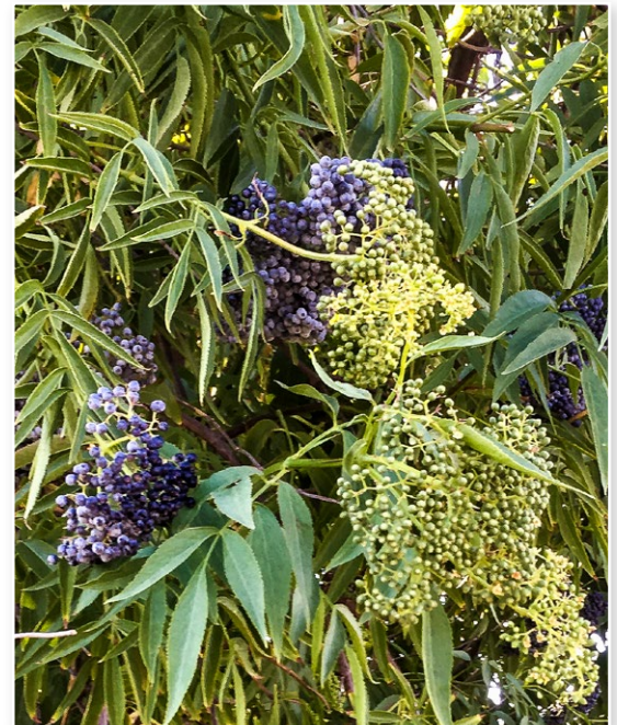
Figure 3. Close-up of a mature blue elderberry shrub during the summer harvest season. It is common to find ripe and immature fruit side by side, especially early in the harvest window, because blue elderberry sets fruit successively over a relatively long period of time.