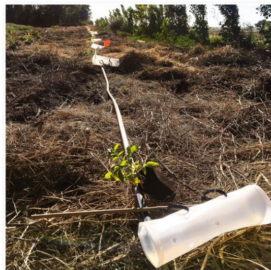
Figure 7. Blue elderberry seedlings in containers laid out for planting on Farm 1 in field demonstration trial. Seedlings were planted in holes punched through cardboard directly next to a 1-gallon-per-hour emitter. Pin flags and tree-protection tubes with bamboo stakes were used to mark and protect young plants.