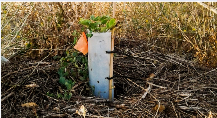
Sidebar 3 figure 1. Elderberry seedling in October after spring planting, surrounded by tall weeds. This planting limited mulching to a 3-foot radius around plants.

The lack of early growth at the first farm was compounded by the farm's approach to weed management, which entailed placing cardboard and crop-residue mulch around each plant in an area whose diameter was 3 feet. The other two farms placed mulch across the entire hedgerow surface area. During the winter rainy season following planting, the first farm experienced such tall weed growth in the unmulched ground between elderberry plants that some of the small plants became entirely engulfed in weeds 6 feet tall (sidebar 3 fig. 1). The resulting stresses likely contributed to a rate of plant death during the rainy season three times greater than the death rate during the summer growing season. Although many elderberry plants survived these challenging conditions and continued to grow over the next summer, these setbacks could likely have been prevented with some tillage and more extensive mulching.