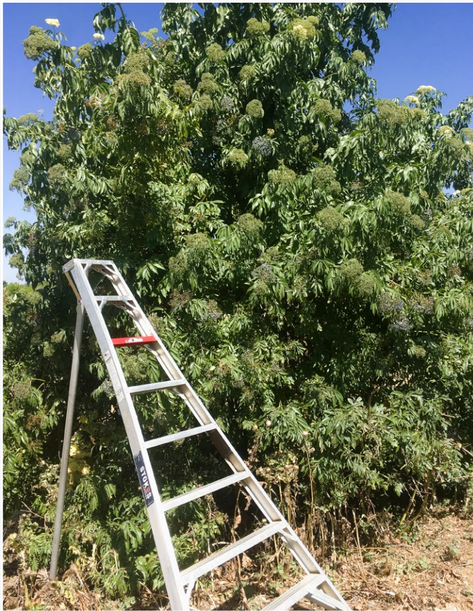
Figure 4. A mature blue elderberry shrub planted in 2012, with an 8-foot harvest ladder for scale. This shrub was harvested weekly in 2018 and 2019 as part of the field demonstration trial discussed in this article.

Elderberry in California hedgerows can be planted alone or in combination with other plant species. If blue elderberry plants are planted in a single line or with other large shrubs, recommended spacing ranges from 4 to 8 feet for denser hedges (Earnshaw 2018) and up to 15 feet for larger plants in a lower-density hedgerow (Long and Anderson 2010). Elderberry plants spaced at least 15 feet apart are more likely to approach their maximum size of 20 to 30 feet wide (CNPS 2021a); spacing plants more than 15 feet apart is an option that may increase ladder accessibility around the entire shrub. Small shrubs, forbs, and grasses can be planted between large shrubs, but may be shaded out eventually, especially with closer spacing of large shrubs. Smaller plants can also be placed in separate planting lines (Long and Anderson 2010; Earnshaw 2018) to prevent elderberry from shading them out. Alternatively, one can plant spreading species like yarrow, which will eventually migrate out of shady areas.