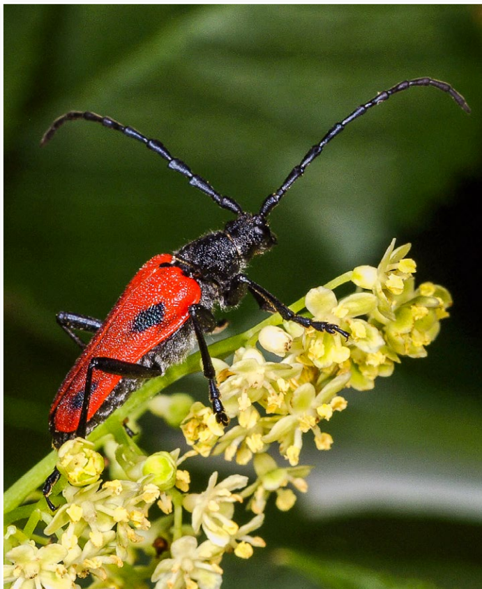
Figure 11. Adult male valley elderberry longhorn beetle.

Note: This table shows average the amount and cost of harvest and destemming labor per pound of destemmed berries, where labor costs $15 per hour. Frozen berries were destemmed by hand. Harvest labor includes orchard ladder use. Berries were harvested by hand-plucking whole berry cymes. For a more complete accounting of costs of establishment and early returns in three elderberry hedgerow styles, refer to UC Davis Cost and Return Studies, coststudies.ucdavis.edu , and search for “blue elderberry.”