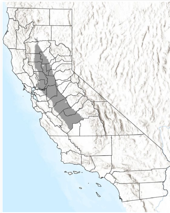
Figure 12. Map of California, showing the area of the Central Valley below 500 feet in elevation—also the suspected range of the valley elderberry longhorn beetle. Note: This map is provided for general reference only and is not to be construed as a definitive determination of the presence of the valley elderberry longhorn beetle. For specific guidance on the presence of the valley elderberry longhorn beetle in any specific area, contact local officials of the U.S. Fish and Wildlife Service.

Harvesting of flowers or berries is not restricted in any way. Due to restrictions on trimming and removing plants, producers wishing to grow blue elderberry are advised to limit planting of elderberry to hedgerows, where the plants become part of a permanent conservation feature with no expectation that major pruning or whole-plant removal will be required in the foreseeable future (unless the land has been entered into a programmatic safe harbor agreement).