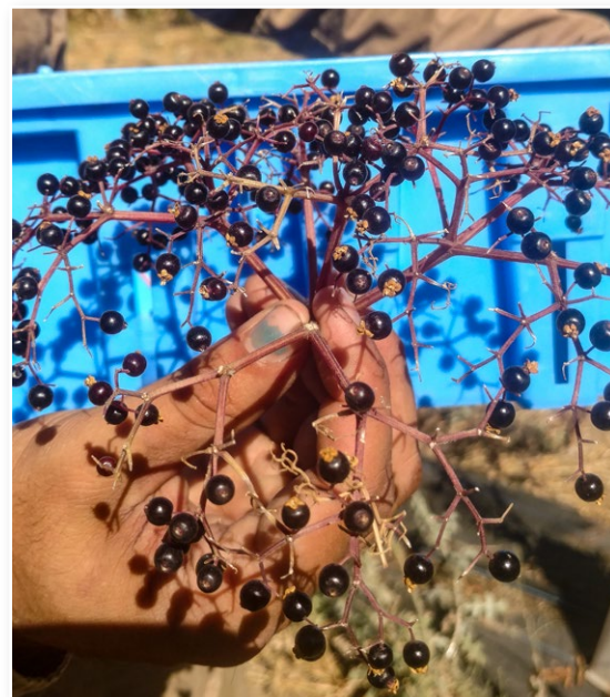
Figure 9. Ripe American elderberry cyme. During the field demonstration trial, ripe American elderberry cymes were frequently filled only partially, as shown here. Note the lack of a waxy white bloom on the surface of the berries, which is typical of American elderberries and distinguishes them from blue elderberries.

When just ripe, the berries of blue elderberry plants develop a dusty white bloom. As the berries continue to ripen on the shrub, the bloom will fade, leaving shiny, dark, blue-black berries (fig. 8). Blue elderberries can be harvested at any point after the bloom develops, but berries are generally sweeter and more evenly ripened if harvested after the bloom begins to fade. The berries of American (fig. 9) and European elderberry do not develop a bloom. Harvest whole cymes once all the berries in the cyme are blue-black. Cymes should not be harvested if any of the berries are