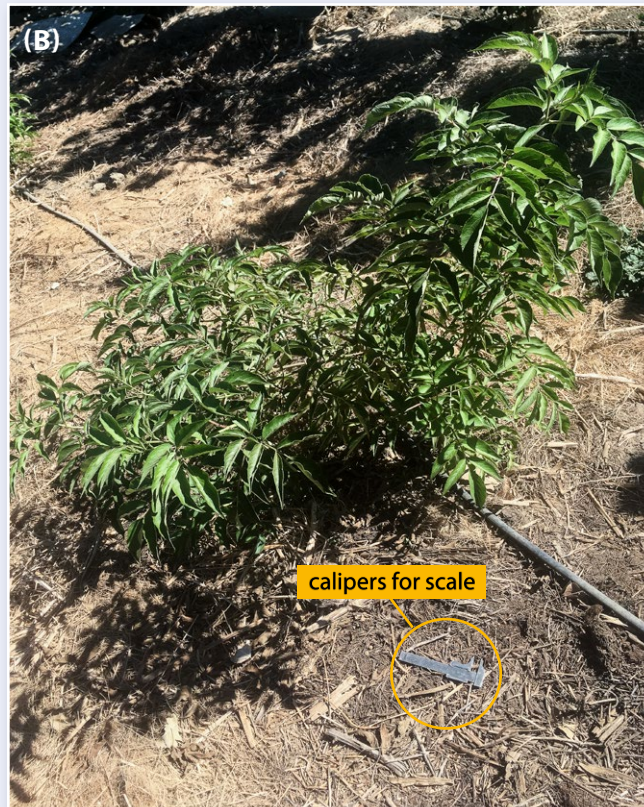
Sidebar 2 figure 1. Blue elderberry seedlings grew more vigorously than rooted cuttings of American elderberry cultivars Johns and Adams at field sites. Shown here are one blue elderberry (A) and one American elderberry plant (B) late in their first growing season. See the calipers on the ground, and poplar trees in the background of panel A, for scale.