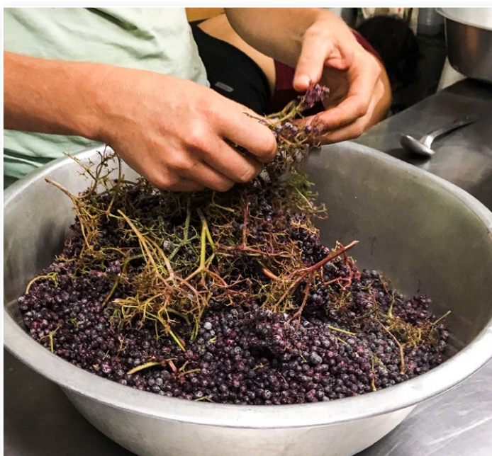
Figure 10. Destemming frozen berries by hand.

Unfortunately, medicinal components of elderberries also break down during processing (Senica et al. 2016). Processors must balance the need for heat application to reduce sambunigrin levels with the desire to maintain medicinal anthocyanins and other compounds.